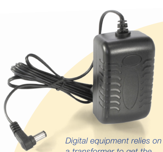
Digital equipment relies on a transformer to get the low-voltage direct current needed to operate.

Additionally, research has found that every 1 percent change in voltage has a corresponding 1 percent change in power usage. As a result of these factors, utilities strive to keep the voltage that's delivered to within the standard range.