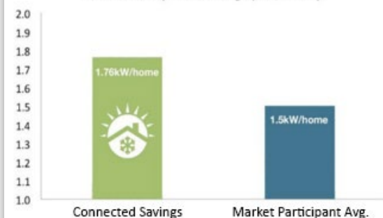
Demand Response Savings (kW/home)